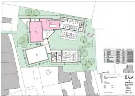
The new plans with the situation from 1994 in pink.

The generous donation of 600,000 euros from the VriendenLoterij is a very important step in the realisation of the plans. In addition to the VriendenLoterij, the Municipality of Veere provides a considerable part of the required amount. Moreover, national and regional funds, sponsorship and private support are called upon. The museum hopes to open in 2024 or 2025 with a completely renovated museum.